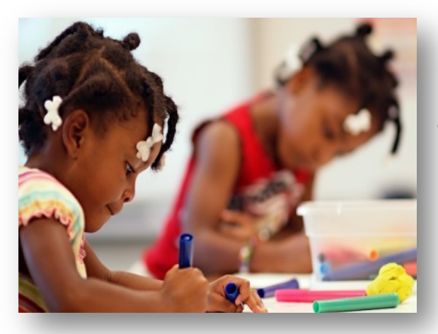
ONE WEEK PROGRAM: COST OF FOOD AND SUPPLIES FOR ALL LOCATIONS : $975 CATALOG NUMBER: CI-110

Cathedral International's Vacation Bible School (VBS) is a weeklong specialized education opportunity for both children and adults. The VBS is intentionally designed to deepen a hunger for God and His Word, to reinforce the church's mission Evangelize, Educate, Emancipate, Empower and Expand! Students play with purpose as they create theme based arts and crafts projects; explore their dramatic talents through acting.